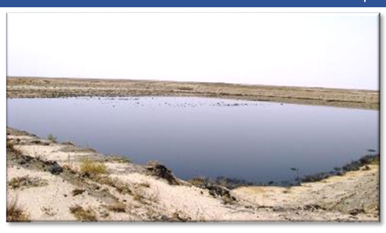
Crude Oil Waste - Kuwait Oilfields