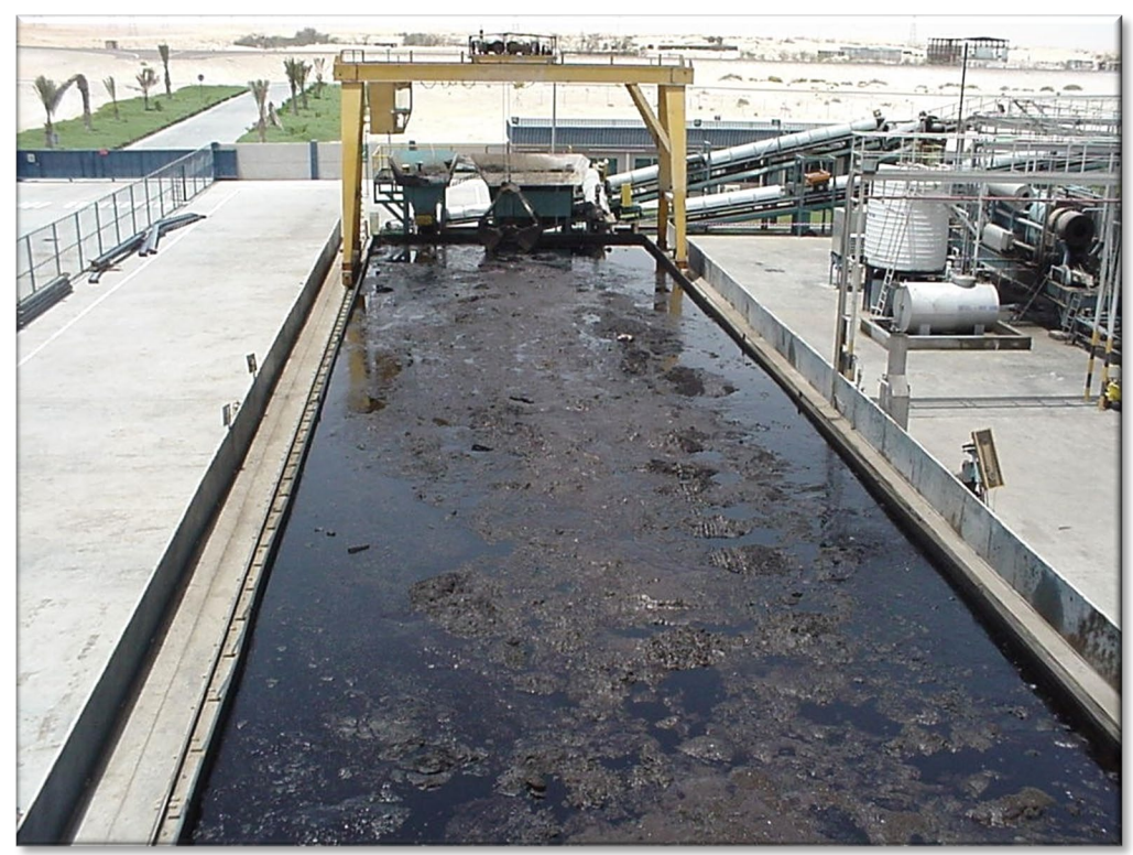
Drill cuttings in receiving pit prior to treatment

RLC Technologies was contracted to manufacture equipment to be used for the ADCO drilling operations in Habshan, UAE. The equipment was used to process drill cuttings. The waste was be treated to reduce the Total Petroleum Hydrocarbon (TPH), as per EPA procedures SW846/8015B and 1664, to below an environmentally acceptable limit of 0.5% Weight/Weight and to satisfactorily dispose of or recycle all recovered solids, liquids and other material used in the performance of the Services in compliance with all applicable environmental laws, regulations and also ADNOC / ADCO guidelines. This facility was installed as an expansion to the existing ATDU facility installed the year previous. The two systems operated in parallel.